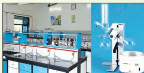
Pharmaceutical Chemistry Lab