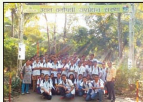
Medicinal Plant Garden

EXTRA CURRICULAR ACTIVITIES: Aidel Education Trust believes in the overall development of students by providing in addition to academics, facilities that would bring out the sportsmanship and team spirit. While a huge ground is being developed for the purpose, games like Carrom, Chess, Volleyball, Football, Cricket, Badminton etc. have already been provided for. The students celebrate the Sports Week and Annual Day every year with a great deal of enthusiasm. 'Coalesce' the annual magazine, a combined effort of the staff and students, is released every year on the Annual Day as a part of 'Spectrum' which comprises all the activities in the campus.