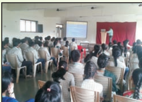
Guest Lecture on "Regulatory Affairs"

SKILLS TRAINING FOR EMPLOYABILITY PROGRAMME (STEP) is a student driven initiative for all the branches at St. John Technical Campus. A team comprising of second, third and final year students and technical experts within and off campus have collaborated to develop students technical competencies. The purpose of STEP is to update and train students with latest technical developments happening in the industry, through various activities like Workshops, Seminars, Industrial Visits and Certification programmes thus bridging the gap between Industry and Academia