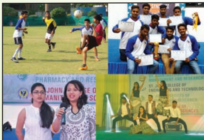
Sports & Cultural Activities

EXTRA CURRICULAR ACTIVITIES: Aidel Education Trust believes in the overall development of students by providing in addition to academics, facilities that would bring out the sportsmanship and team spirit. While a huge ground is being developed for the purpose, games like Carrom, Chess, Volleyball, Football, Cricket, Badminton etc. have already been provided for. The students celebrate the Sports Week and Annual Day every year with a great deal of enthusiasm. 'Coalesce' the annual magazine, a combined effort of the staff and students, is released every year on the Annual Day as a part of 'Spectrum' which comprises all the activities in the campus.