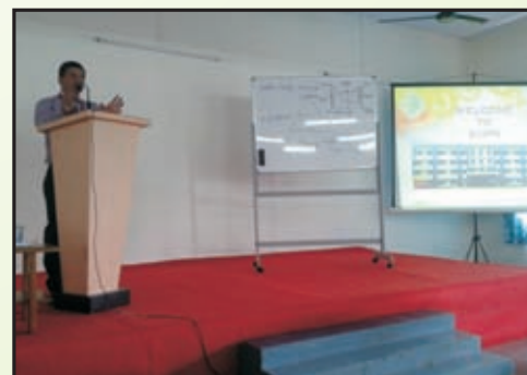
Guest Lecture on "Personality Development"