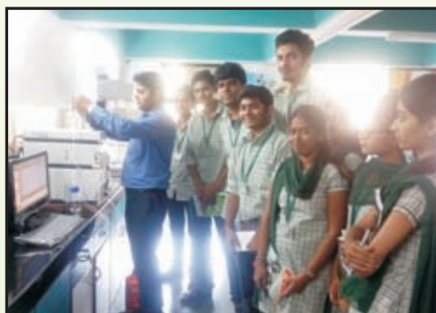
Workshop on Introduction to analytical instruments