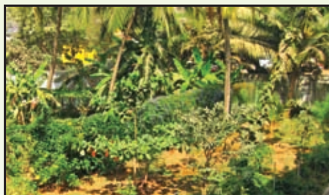
Medicinal Plant Garden